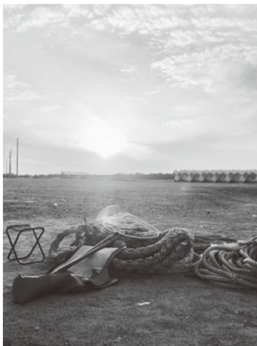
Beautiful sunset at the seaside of Niigata