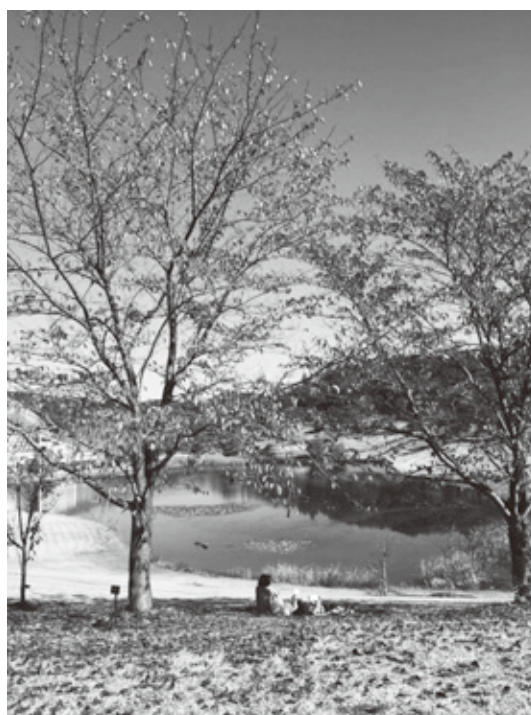
Colorful and scenic view at the Botanical Garden

grandmother. The beauty and color of Japan is a site to behold – hence I feel blessed and honored to see all of these. Next stop was the Niitsu Art Museum, an edifice housing different masterpieces and artworks of known people, It gave us a glimpse of the rich art history of Japan considered as one of the best in the world. Last point was the Aeon Mall, I enjoyed browsing through shops and indulging myself with the delightful sweets and foods on display. Every presentation is a work of