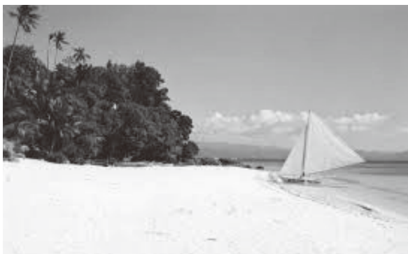
Picture of one the beach in the Philippines called Boracay Island

I was born and raised in a tropical country, the Philippines. It is composed of 7,107 islands surrounded by a vast body of water. The Philippines is tagged as calamity ridden country where typhoons come and go, and earthquake usually occurs. Though behind all these, are richness in natural resources; stretches of fine beaches, lush forestation; deep rooted family ties and a passion for their faith. The people while known to the world for their music and fun loving ways with happy smiles despite adversities are called Filipinos. I am strengthened in character by difficulties in life and yearning for higher education to be shared with my countrymen.