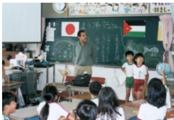
Taking part in introducing my country to elementary school students, who were very keen to listen to what I said

civilizations can still be seen today. As the crossroads of the Middle East, the lands of Jordan and Palestine have served as a strategic nexus connecting Asia, Africa and Europe. Thus, since the dawn of civilization. Jordan's geography has given it an important role to play as a conduit for trade and communications, connecting east and west, north and south. Jordan continues to play this role today. Because of its centralized location, the land of Jordan is a geographic prize which changed hands many times throughout antiquity. But since the mid-seventh century AD, the land of Jordan has remained almost continuously in the hands of various Arab and Islamic dynasties. You can see the fingerprints of those people by visiting the different places in Jordan. Amman, Jordan's present capital, has the old roman theatre standing side by side with the new buildings. Petra, in the picture of Petra, where the city entrance can be seen, just before it ends, where you can see the most beautiful part of Petra, the Treasury south is the ancient city