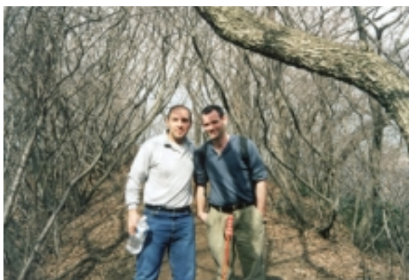
A picture with a friend, while climbing Kakuda mountain here in Niigata

What did I expect to see in Japan and Niigata? A country with a special land, unique people, customs and habits. A land, with a beautiful nature and amazing architecture.