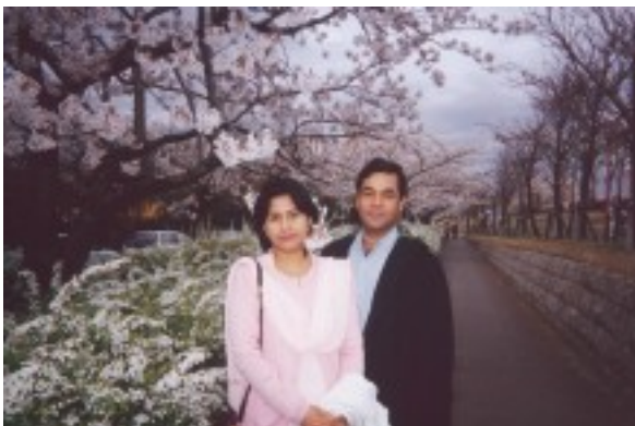
A picture with my husband by the river of shinano during cherryblossom viewing.

At my department, I have always to speak Japanese so, some time I mistake when I want to speak English.