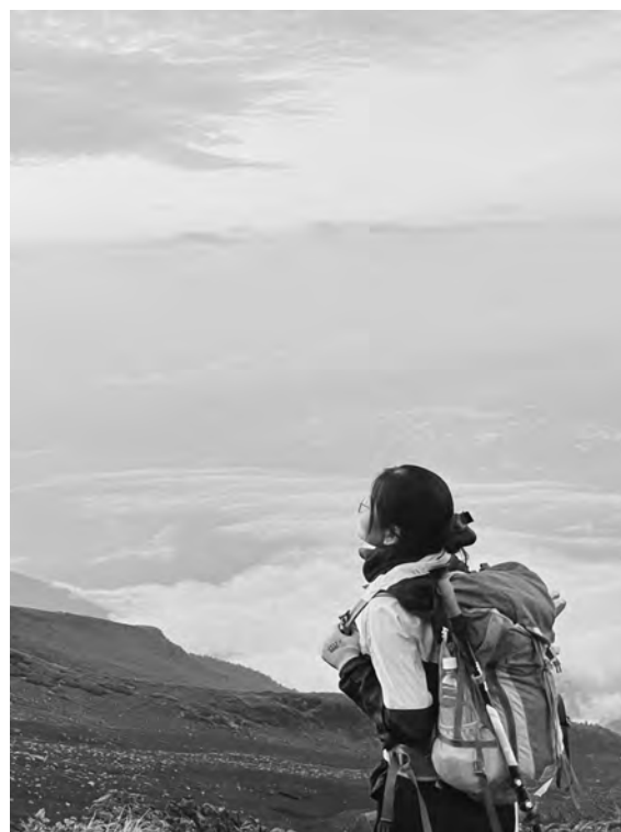
Summer: Fujisan 8/2023