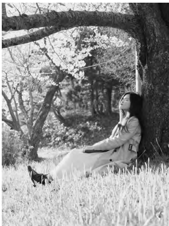
Spring - Niigata 4/2023

I was so worried because, honestly, I had very little experience with scientific research before. The PhD program itself felt like an endless ocean. Every day, I delved deeper into a world of complex research, academic papers, trials, and failures. I often found myself doubting my abilities: