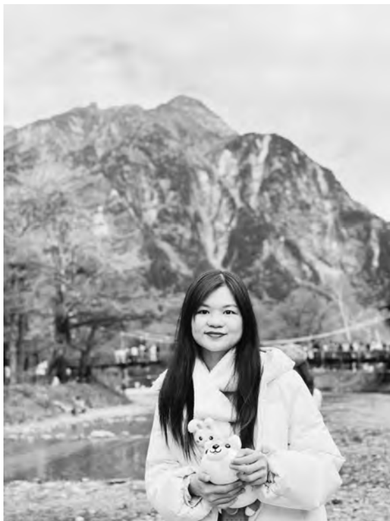
Autumn: Kamikochi 10/2024

research, I feel very fortunate to have the time to explore new places, through opportunities to attend scientific conferences and also by traveling on my own. As a country with a rich history and tradition, each prefecture in Japan has its own unique cultural characteristics, from mascots and famous foods to special souvenirs that represent the area. Everywhere I have traveled, I have had the chance to enjoy beautiful natural landscapes and learn a lot about Japan's culture and history. One other form of travel that I find particularly interesting, and is also one of my hobbies, is hiking. As a hiking lover, Japan has been a wonderful place for me to explore and enjoy the mountain views. The mountains here are spectacular, and every hike brings a sense of peace and adventure. The most remarkable experience was the opportunity to climb Mount Fuji to its summit. It was truly unforgettable. The climb was difficult, my legs ached, and I questioned whether I could