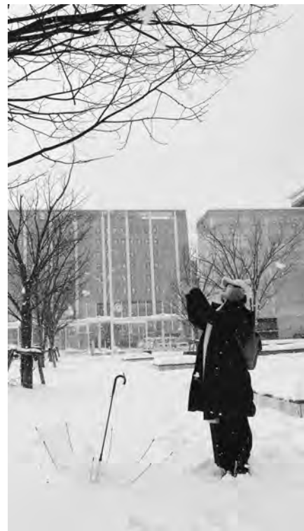
Winter - Niigata 1/2023