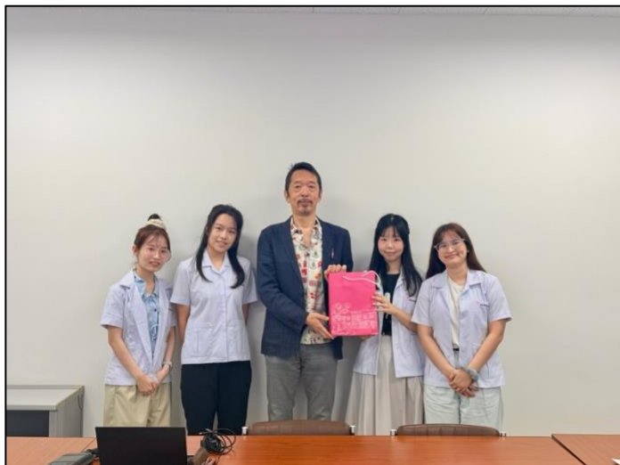
Photo 1. Greetings and Lecture by Dean of Faculty of Dentistry at Niigata University